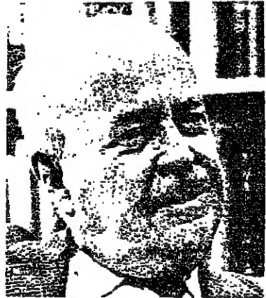
Prof. TALCOTT PARSONS — Professor of Sociology at Harvard University, Prof. Parsons is a former President of the American Sociological Association and the American Academy of Arts and Sciences. He was instrumental in transforming sociology into a unified and accepted discipline. His monumental work, The Structure of Social Action, has had a unique impact on the study of society. Considered a leading statesman of sociology in the U.S. and throughout the world, he is also a foremost defender of academic freedom.